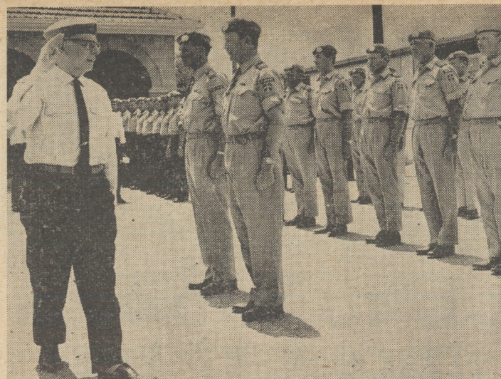
The Force Commander inspecting elements of the Australian, Danish and Austrian civilian police during his recent visit to UNCIVPOL.