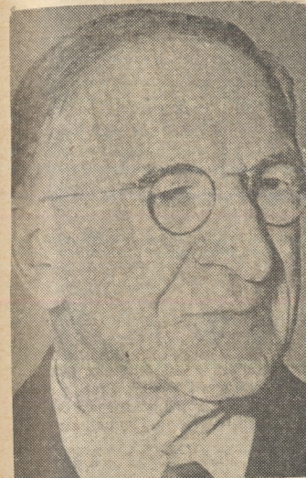
Eamon de Valera Uachtaran na hEireann

MR. Eamon de Valera (below) has been re-elected for his second seven-year term as President of Ireland. The inauguration will take place on