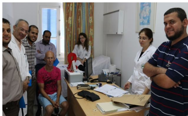
Clinicians discussed case management of HIV/AIDS, Fattouma Bourgiba Teaching Hospital, Monastir, Tunisia.

On 1 August 2016, the World Health Organization (WHO) Libya conducted a 12-day clinical attachment training on “Clinical Management on HIV/AIDS for clinicians” in Fattouma Bourgiba Teaching Hospital in Monastir, Tunisia. The training aimed to build the capacity of the Libyan clinicians on Antiretroviral Therapy (ART) and expand the use of antiretroviral drugs (ARVs) for HIV prevention in Libya. The participants came from all over Libya working in infectious disease departments. The course included the epidemiology of HIV/AIDS, HIV transmission modes, the WHO guidelines of when to start ART and on pre-exposure prophylaxis for HIV/AIDS, first visit of people living with HIV, preparation to ART, clinical assessment, routine investigation and monitoring, treatment of HIV infection and coinfection, adherence, and prevention for further transmission.