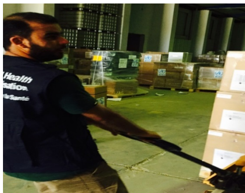
Storing medical supplies in Tripoli Medical Office, Libya