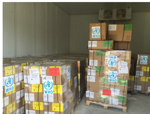
Medicines at Medical Supply Organization Tripoli for distribution to different hospitals in Libya