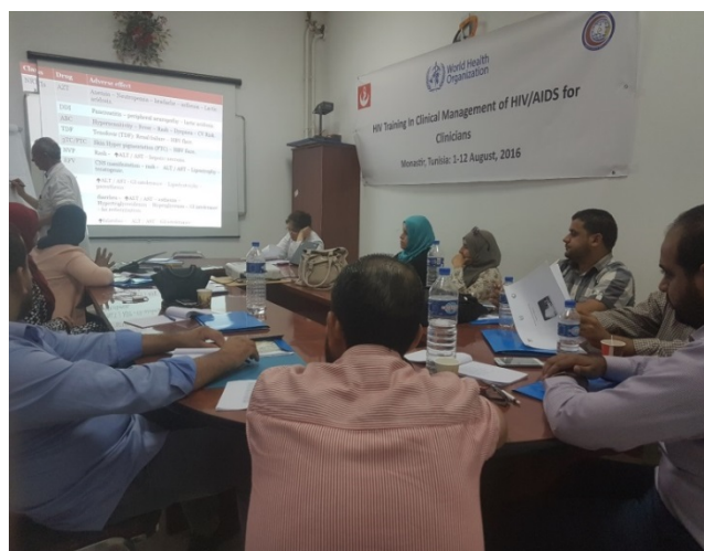
Participants having group training session on clinical management of HIV/AIDS with Consultant, Fattouma Bourgiba Teaching Hospital, Monastir, Tunisia.