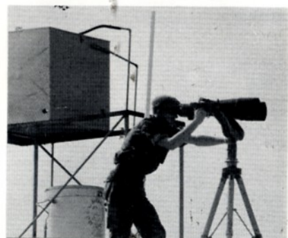
United Nations soldier using skill and patience. iment, Royal Artillery - and wish them a successful tour.

We will depart soon but UNFICYP carries on. We welcome our successors - 2 Field Reg-