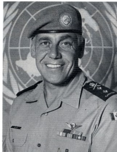
Major General C. Milner

but in the knowledge that it is for a most worthwhile cause - that of peace. As such your contribution is invaluable, recognized and appreciated. I commend all of you for your dedication and perseverance, your patience and good humour, and I wish all of you a happy and safe Christmas and a peaceful New Year.