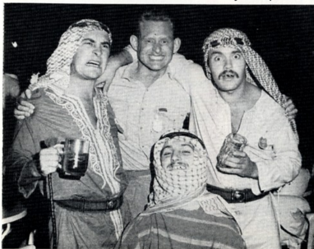
The Raghead Syndicate! at the Melbourne cup.

For 25 years now UNFICYP has been in existence and even though some progress has been made hopefully a solution is not far away - one must always have a positive attitude. I would like before I die to return one day to a united Cyprus and feel that in my own small way that I had contributed to such an achievement.