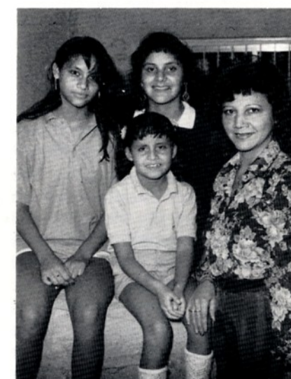
The Cornejo family