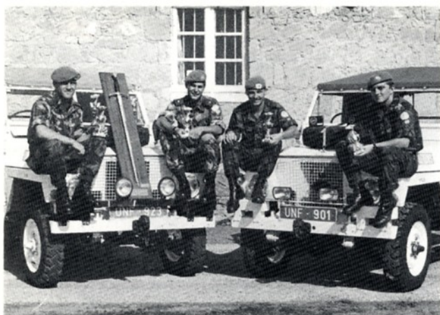
The Tpt Sqn team.