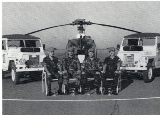
The UN Flt team.