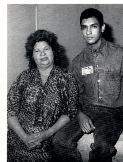
The Orozco family