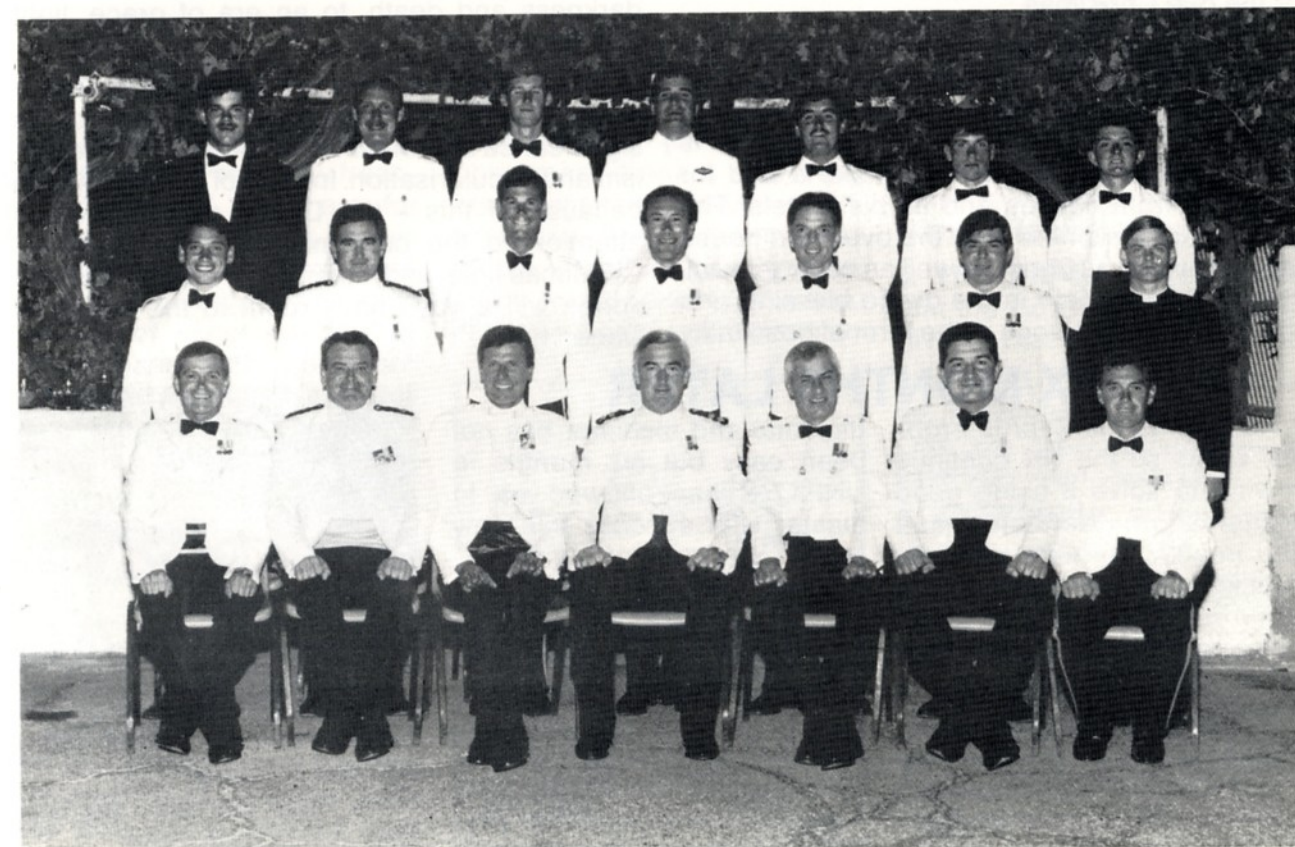
The officers of Support Regiment