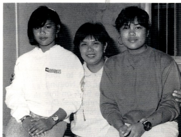
The Secondes family