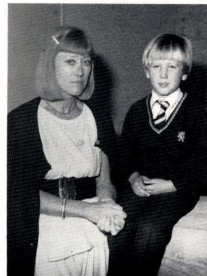
The Wikstrom family