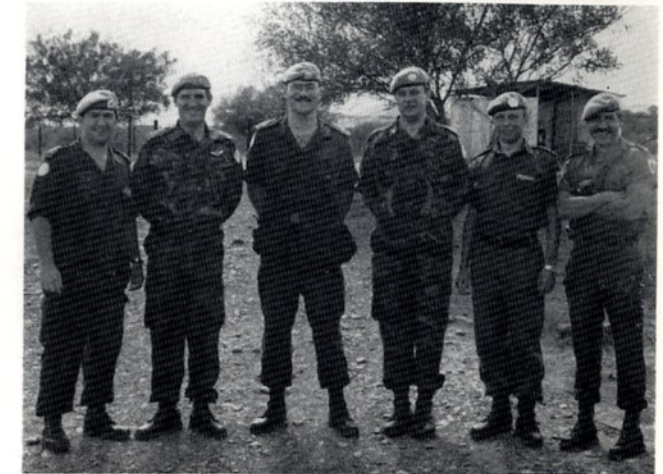
HQ UNFICYP winners of the Team Pistol.

"Load...Ready?... Anyone not Ready?...Fire".