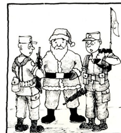
I told them! But they said NOONE gets into the BZ without a pass!

9. MISTLETOE. (Unfortunately this is a wasted gesture since everyone we want to kiss is in Cyprus).