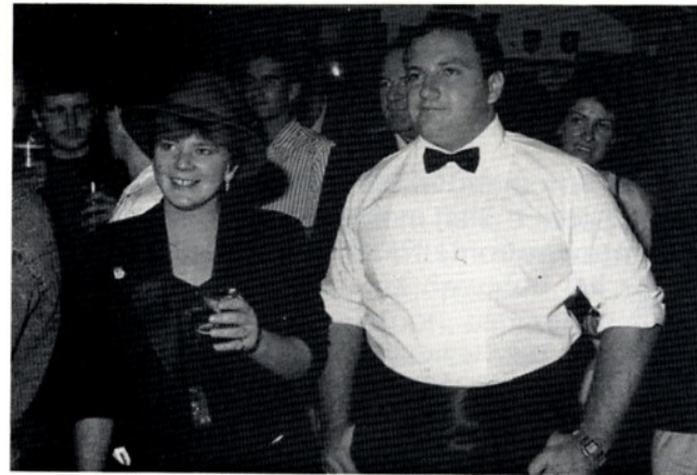
People anxiously awaiting the draw of the Melbourne Cup.